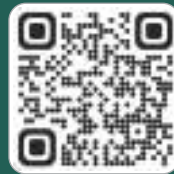
Scan for site location